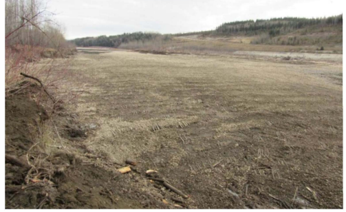
Installation of cuttings Live gravel bar staking Completed project